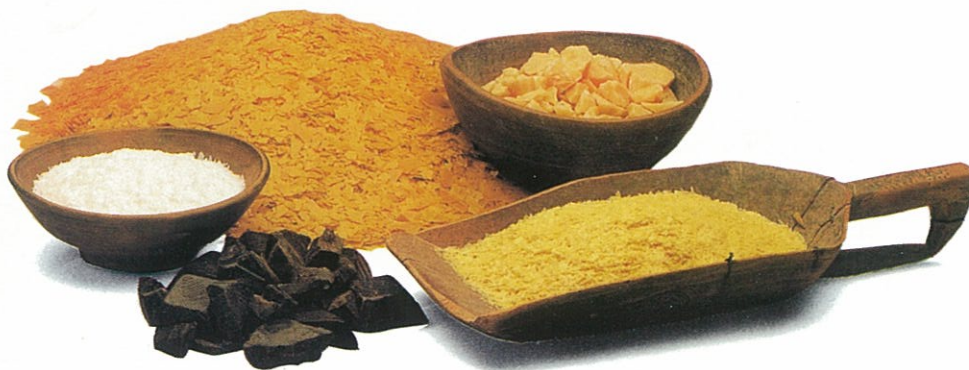
The precious raw materials: Brazilian Carnauba wax, beeswax, vegetable waxes and montan waxes.

On following pages you will find a detailed explanation of our systems for the production of waxes and similar products, for an increasingly experienced and exigent clientele that demand specific and diversified products.